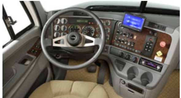
The roomy cockpit contains a standard CB Radio, a back up camera, AM/FM/CD player and an optional... Plus, the driver and passenger ride in comfort in Lexington® ultraleather chairs with air/swivel pedals.