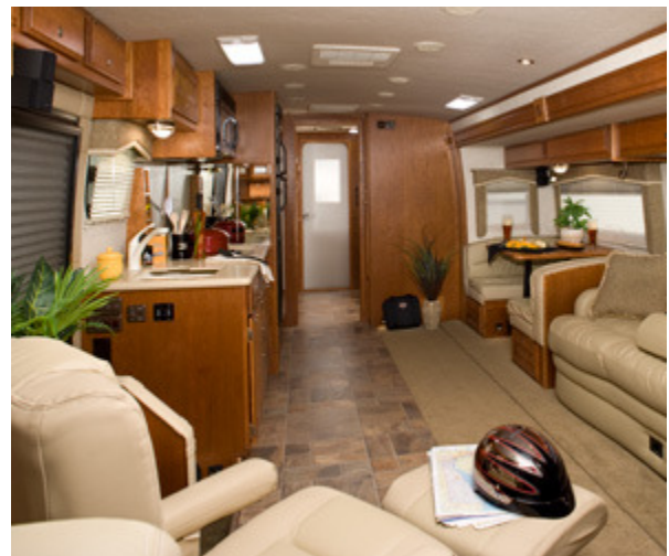
Inside the GC459GT toyhauler you will find a convenient kitchen, a roomy rear bathroom, wardrobes with plenty of storage space, and a large flat screen TV.