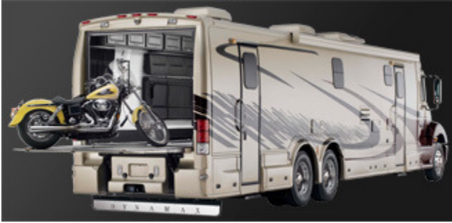
This toyhauler features an 11-12 foot garage and 2,200-lb hydraulic liftgate/door so you never have to leave home without your toys again.

Even with the extra space for the garage, the GC459GT is still as spacious and luxurious as you imagine. Plush ultraleather seating allows you to travel in comfort. And a 23" LCD TV with a Bose 28 DVD/CD Surroundsound® system will keep you entertained until you arrive at your destination.