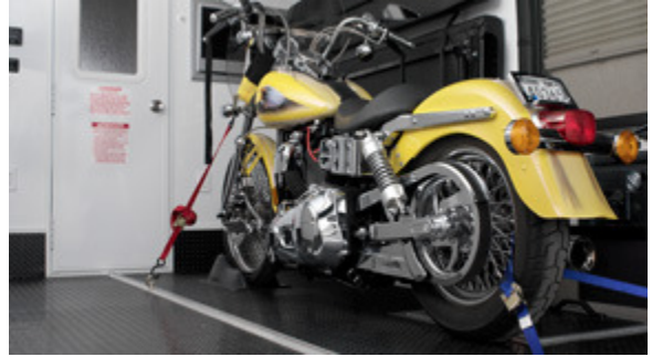
To keep your toys safe and secure during transit, the GC459GT offers adjustable track tie-downs in the garage.