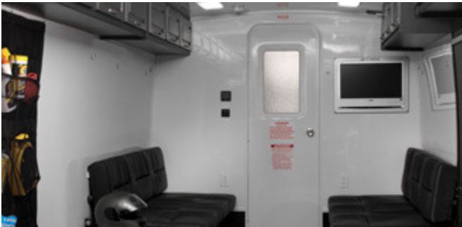
Optional bench seats fold up and out of the way as needed, and overhead cabinets and optional side organizers provide plenty of places to store your gear.