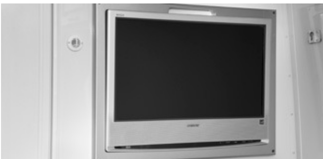
A 32-inch LCD flat screen TV is a most wanted option in the garage.