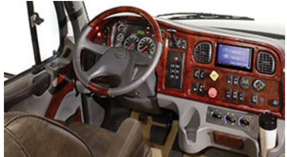
The contemporary cockpit with lots of leg room features cruise control, tilt and telescoping steering column, glass and overhead directional reading lamps.