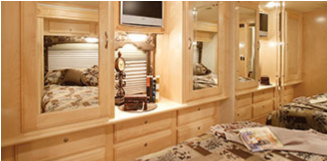
The rear bedroom offers a large, comfy queen size bed and hardwood wardrobes and nightstands.

Extraordinary styling and features abound with a color backup camera and monitor, a 23-inch flat screen TV and a Bose® LS 18 DVD/CD player with Surroundsound®. Four people can live and sleep comfortably thanks to the queen size bed in the rear, the optional Hide-A-Bed sofa and the room with a one-piece fiberglass shower with skylight.