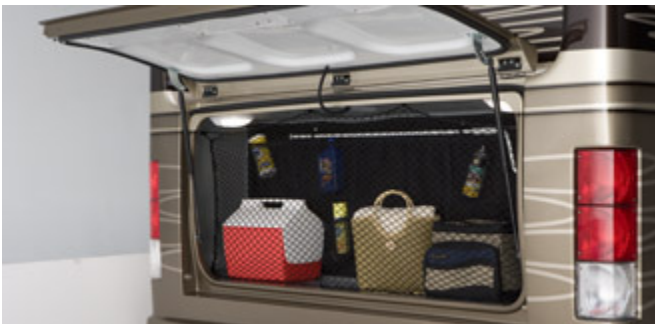
The DynaQuest XL offers a surprisingly large amount of storage. An even bigger surprise is the extra storage available in the rear trunk.