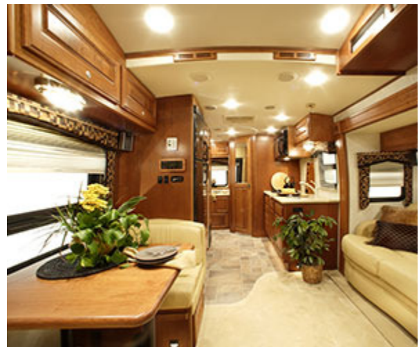
Comfort and styling accentuate the large seating area of the DQ260ST featuring an ultraleather sofa and full-time dinette