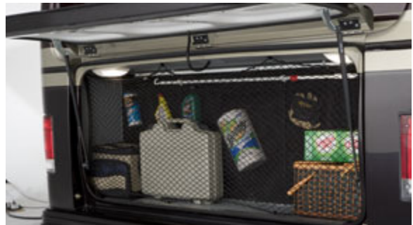
You'll find a surprisingly large amount of storage. A bigger surprise is the extra storage available in the trunk.