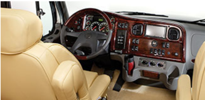
The cockpit is very professional and contemporary with lots of leg room.