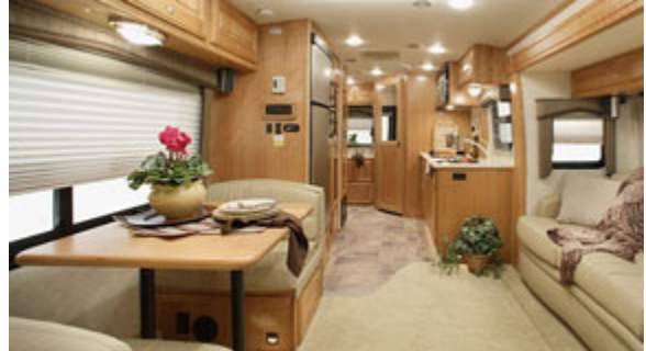
Interior décors include rich, solid wood cabinetry, a beautiful selection of fabrics, sculpted carpet, Corian countertops and more.