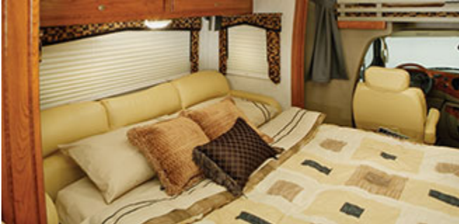
The Flexsteel® Hide-A-Bed sofa transforms into a very comfortable queen size air mattress bed.

Upscale amenities such as a 23-inch flat screen television and a Bose® LS 18 DVD/CD player with Surroundsound® fill the DQ260ST. The dinette and Flexsteel® sofa transform into comfortable accommodations. The living area is surprisingly wide and comfortable, despite its smaller size.